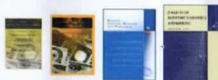
1998 - 2003 2004 - 2005 2005 - 2017 2017 - Now